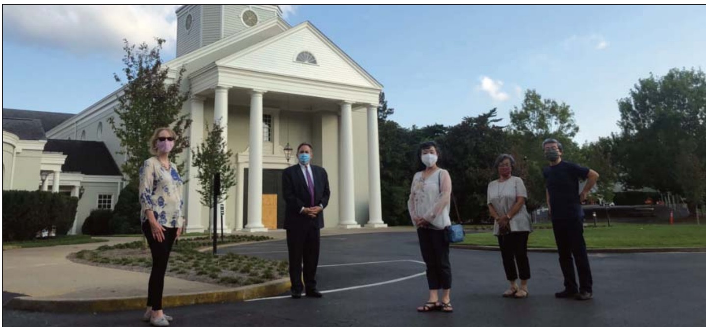
Sister Cities leaders gather at St. George's Episcopal Church to take part in a city-wide bell ringing event honoring the 75th Anniversary of the atomic bombing of Japan and promoting friendship between Nashville and Kamakura