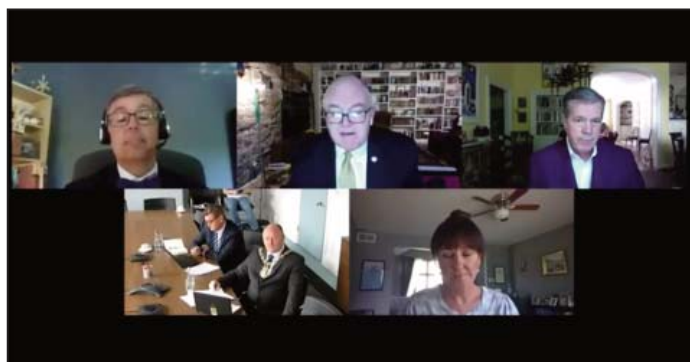
SCN joins with World Affairs Council for conference to promote economic networking between Nashville and Belfast.