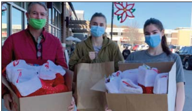
(Above) Youth Advisory Board's service project with Nation's Ministries and (right) virtual education program with Nashville and Caen attorneys.