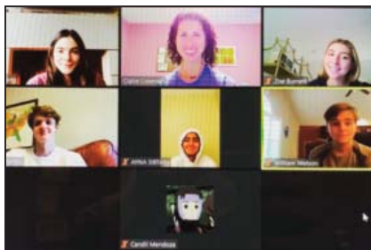
Youth Advisory Council goes virtual.