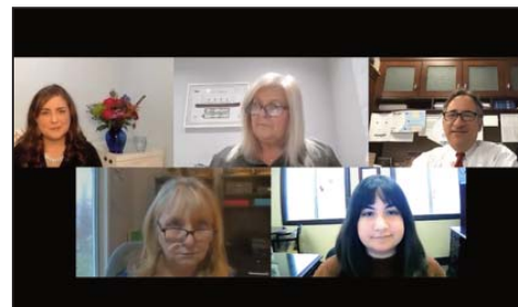
Belfast and Nashville: Women in politics.